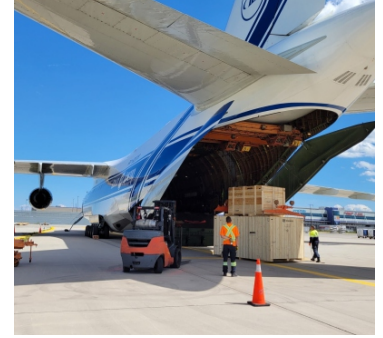
Air Cargo Operations