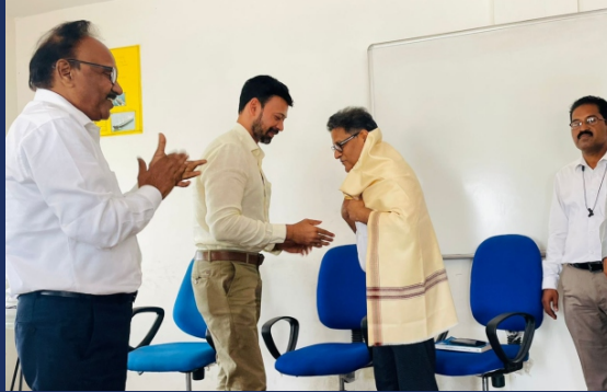
Chief Guests in Campus