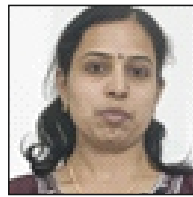
Girija Diploma L&S CTC : 1.9 L