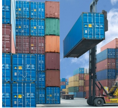
Container Freight Station