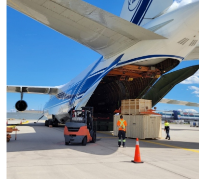
Air Cargo Operations