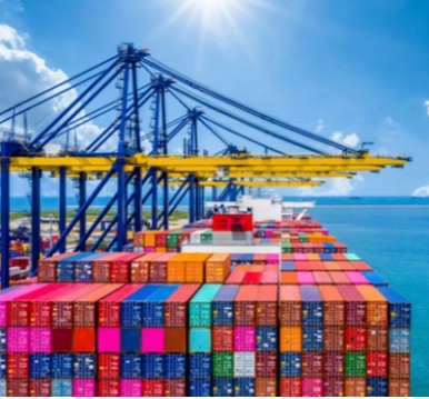
Port & Terminals